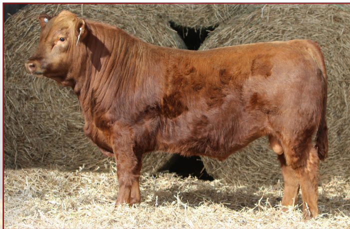
WS Landmark 14L - Ref Sire

LM008 is a powerfull donor who raised raised one of our heaviest weaning weight calves this year. He will highlight our bull sale in the spring! She comes from our best uddered cow family. She will have a black red carrier, 3/4 Sim calf by WS Landmark in May. #2 $Profit in the sale at $32435!